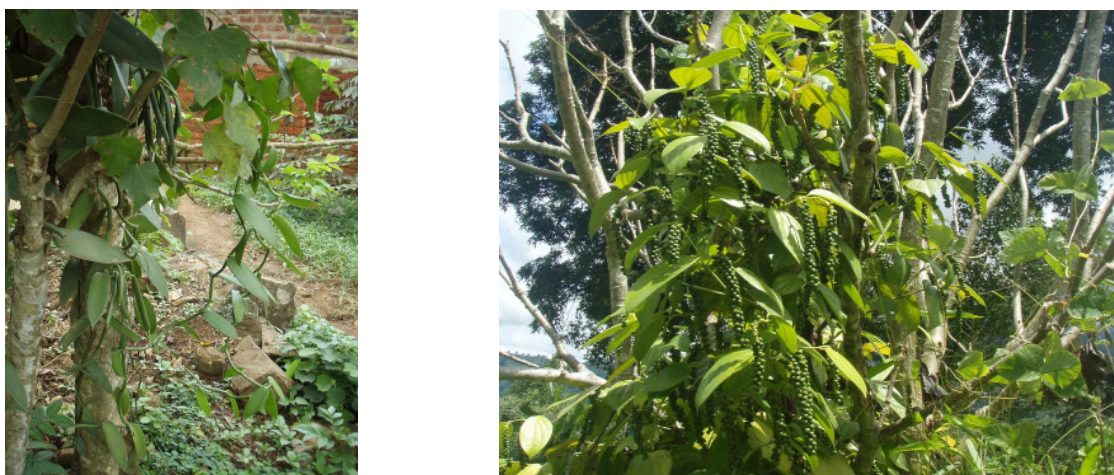
Figure 2: Jatropha as support plant for spices (vanilla and black pepper)